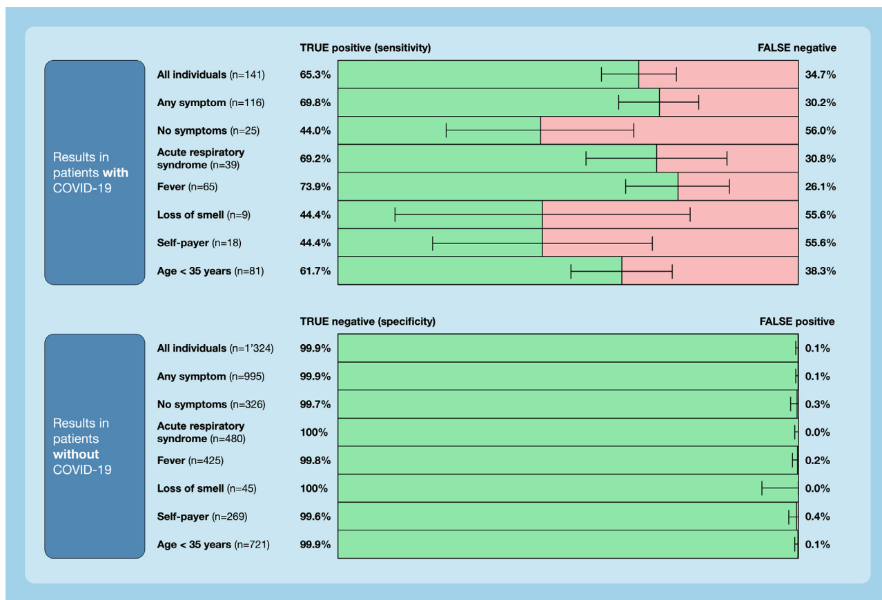
Figure 2. Diagnostic accuracy of the Roche/SD Biosensor rapid antigen test in a real-life clinical setting. 1465 consecutive individuals presenting at a COVID-19 testing facility affiliated to a university hospital between January and March 2021 were studied. Sensitivities and specificities are in relation to RT-PCR, and are given for the overall study group as well as for salient subgroups.